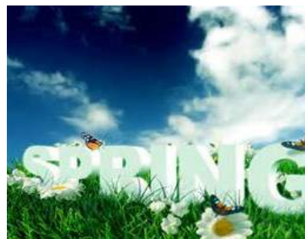
Being outdoors OR indoors quilting—HUM