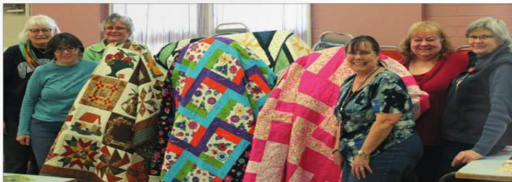
Members of the Sunshine Coast Quilter's Guild display a few of the quilts created during a weekend quilting blitz. A total of 30 bed coverings will be donated to residents of Sumac Place in Gibsons.

Members of the Sunshine Coast Quilters Guild's Comfort Society gathered at the Sechelt Legion Auditorium for an old-fashioned "quilting bee" with new-fashioned equipment. The team pulled together yards of donated fabric, piecing it together in intricate designs and quilting it by hand and machine in equally intricate patterns.