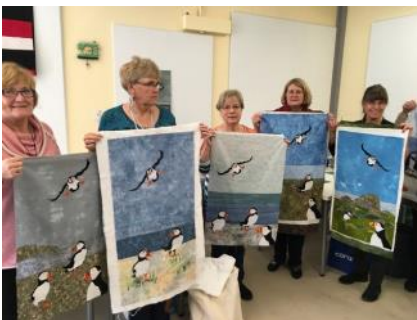
Group of Puffin makers