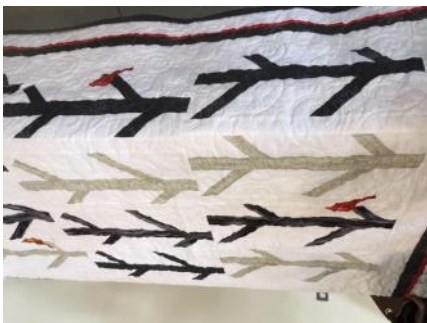
Quilt on display at the March meeting.

We all have strips of batting left over from projects ... the ones I can't put together for a quilt I cut into pieces that will stick to the bottom of my Swiffer mop to clean the floor in the sewing room. It picks up all trashcan oops and then it goes into the trash. Works great on hard surfaced floors.