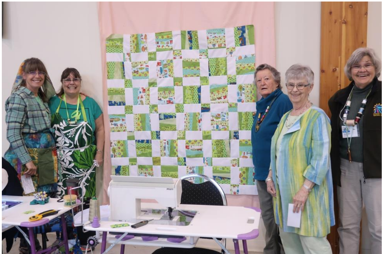
And the Just Ask a Quilter green team makes it to the finish line first.