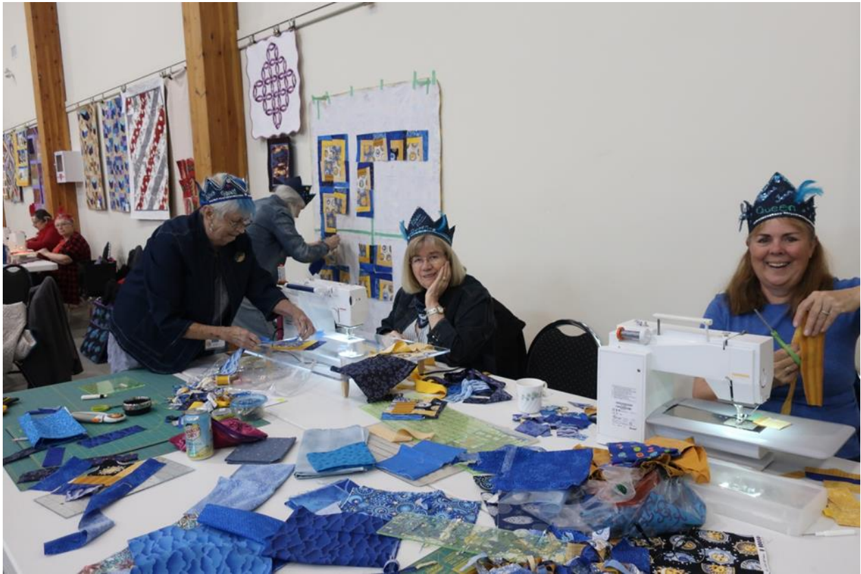
The Blue Jean Queens pulled off the workmanship award.