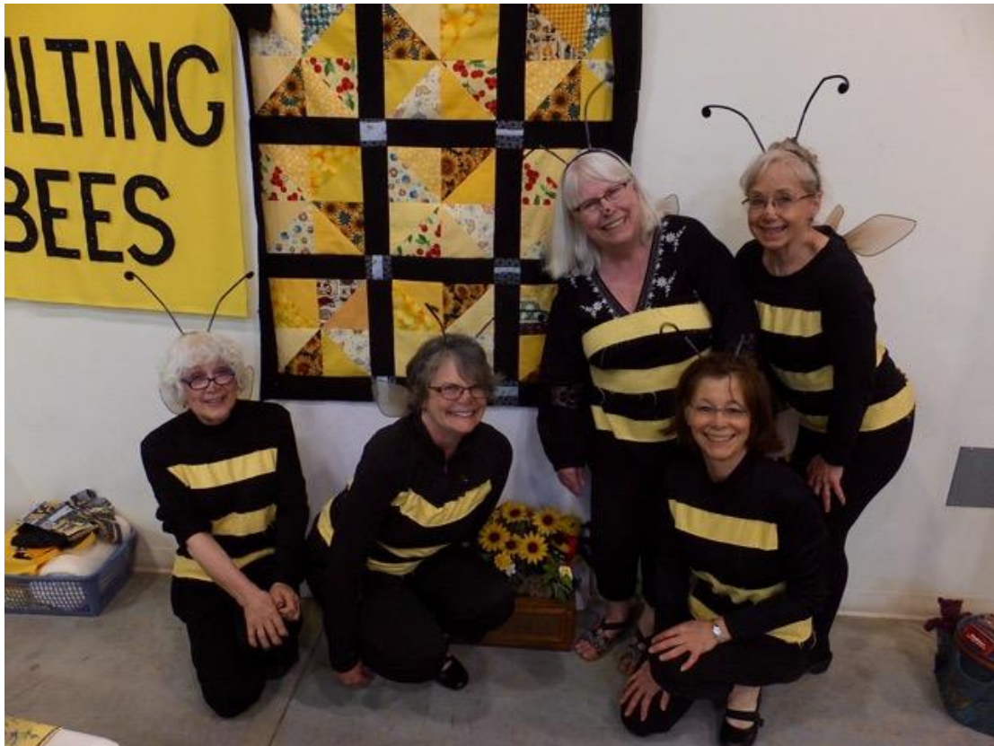
The Quilting Bees were a-buzzing. Full marks for team spirit!