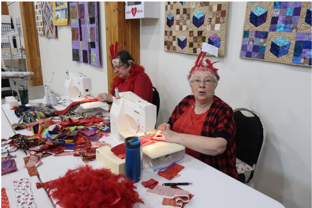
The Red Robins were the “feather weights”. More pictures on page 11