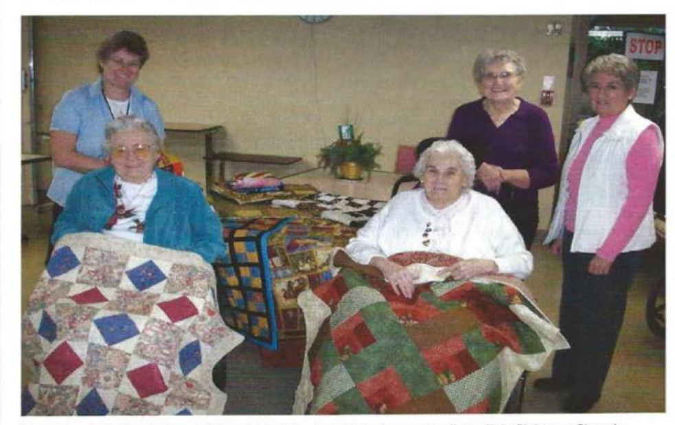
The Ladies of the Comox Valler Schoolhouse Quilt Guild have been spreading a little Christmas Cheer by delivering quilts to four places.

Note from the Editor: Because the Hands Across the Water pictures were low resolution pictures, we were not able to print them here. We have, instead, some recent pictures of donations made by the hosting group – Comox Valley Schoolhouse Quilt Guild.