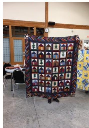
Quilts from Show & Tell Nov/19: