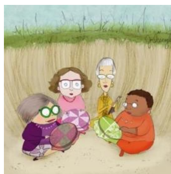
Stitch in the Ditch Club