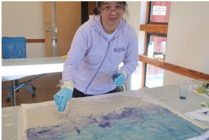
The second day was all about the design with many flowers blooming!