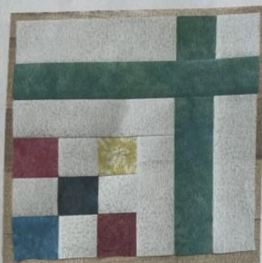
Block name: Back Track