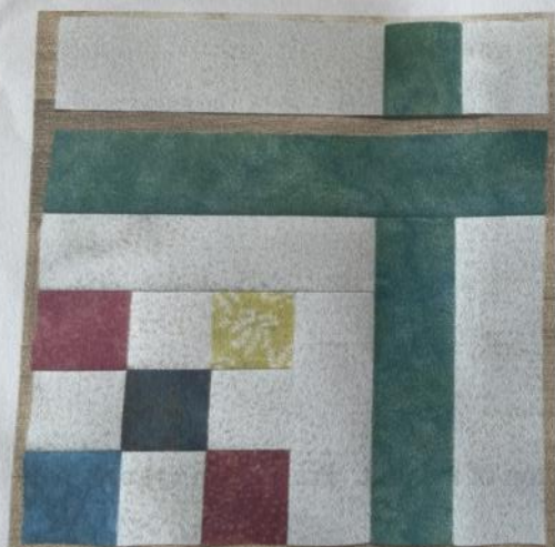
Sample layout of blocks ....