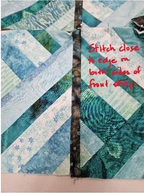
View of quilt front: